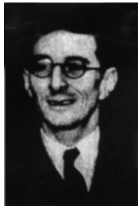
BARONET ACLAND, M. P. "The whole structure of society is rotten."

Conspicuously absent from the Malvern Conference was the suave, sail-trimming Archbishop of Canterbury, the Most Reverend and Right Honorable Cosmo Gordon Lang, evictor of Edward VIII now 76 years old, whom William Temple may eventually succeed as Primate of All England.